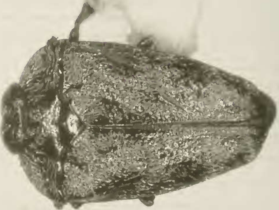
Fig. 2. Pachyschelus signatus Waterhouse, 1889.